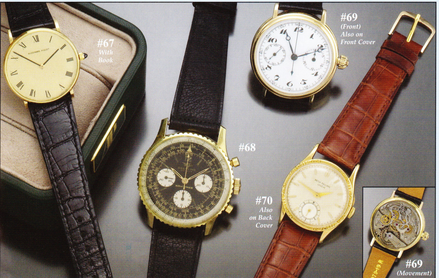
#67 With Book