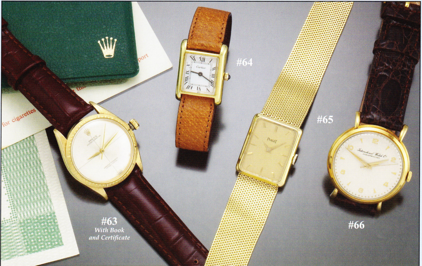
#63 With Book and Certificate